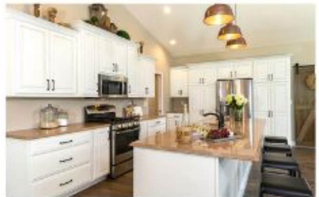
© The Beveled Edge Marble & Granite Counter Tops

Shiloh Cabinetry is available in most areas, except the northwestern United States.