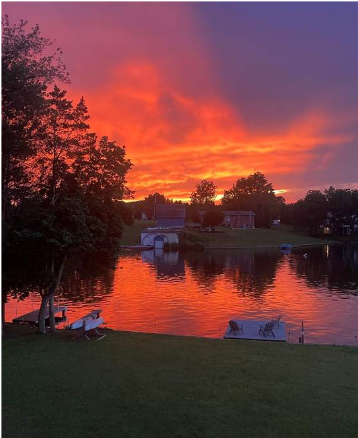
June 28, 2025, after a thunderstorm.